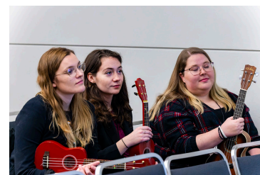
Ready for the Ukulele Flash Mob!